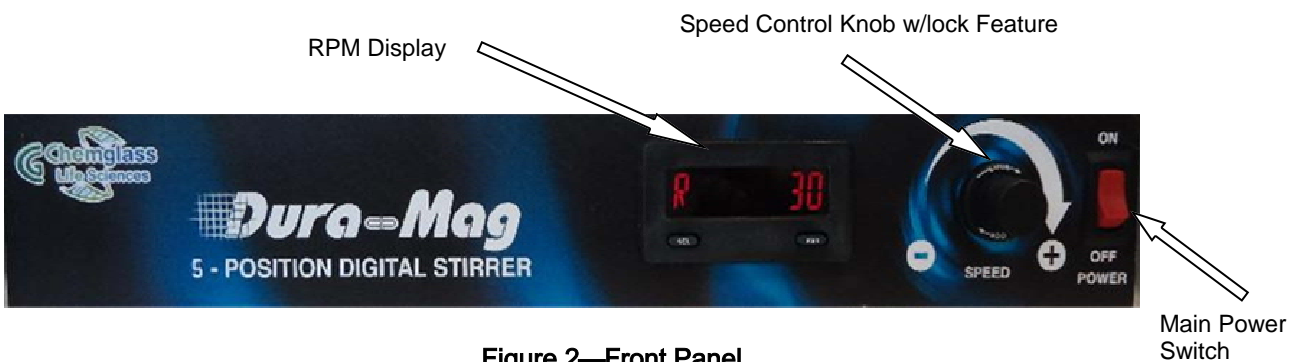
Figure 2—Front Panel

To operate, turn the main power switch to the “ON” position. Turn the speed control knob to set the desired rpm value. The units are designed to operate within a range of 10-400 rpm. Adjust the speed by turning the speed control knob, CW to increase speed, CCW to decrease it. The unit will ramp up (or down) to your selected speed. Turn the “LOCK” ring clockwise about an eighth of a turn to prevent any inadvertent changes to the set speed. Turn the “LOCK” ring counterclockwise to unlock the speed control knob.