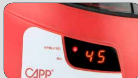
Bright digital display for speed and time.